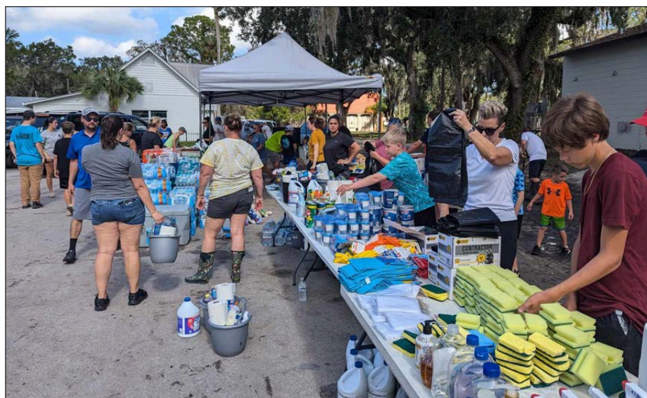
Numerous volunteers get to work providing food and supplies to residents in Homosassa following Hurricane Helene.

Reservations for this annual luncheon are only $35 and must be made in advance online at www.CitrusCountyChamber.com . Table sponsorships are also available. Please contact Corrine to inquire at Corrine@CitrusCountyChamber.com or call 352-795-3149.