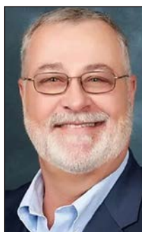
Sen. Ben Albritton